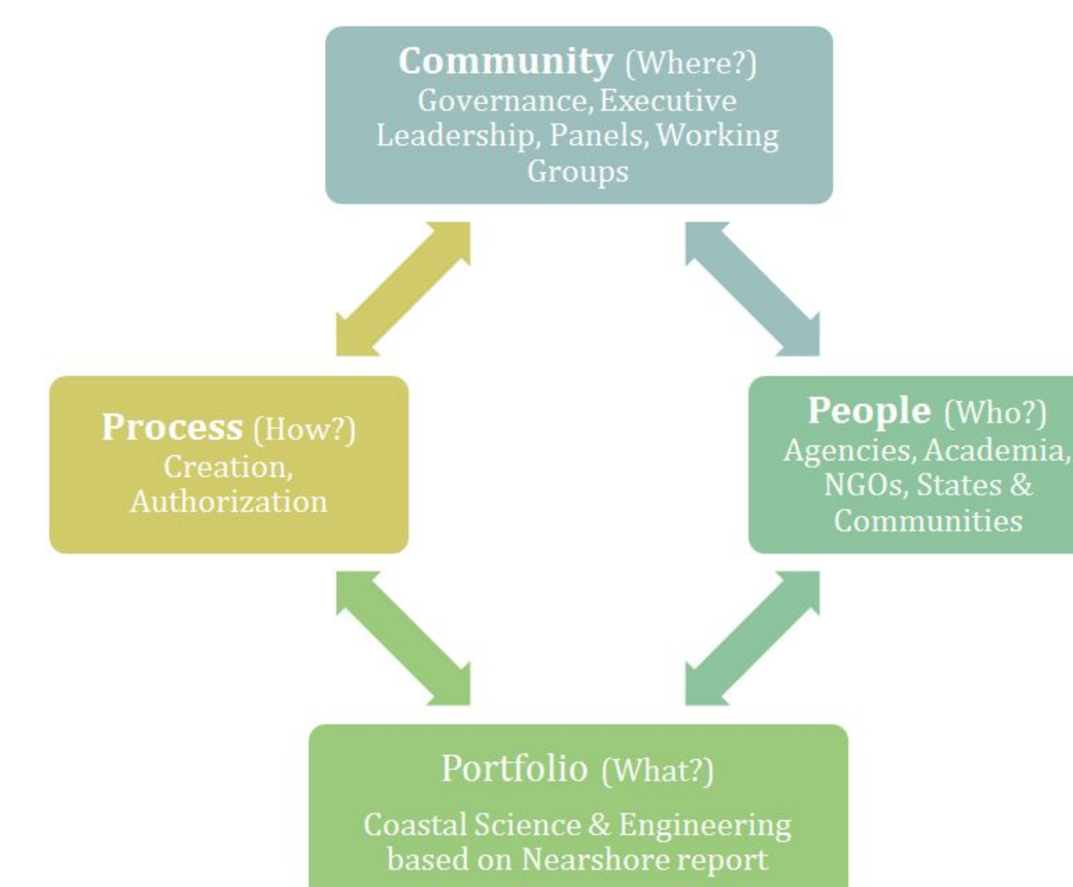
Figure 3. Strategic Plan for U.S. Coastal Research Program development