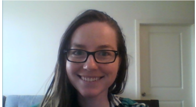
Example of good background and making eye contact.