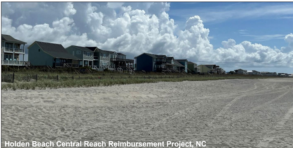
Holden Beach Central Reach Reimbursement Project, NC